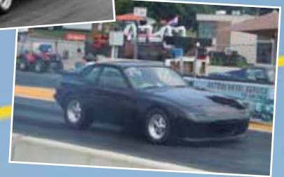
Black Pearl built by Miramar High School Porsche 944 10.623 @ 122.56 mph