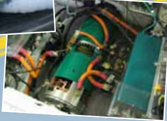
Siamese Warp Impulse 9-inch motors, a Zilla 2K amp controller fed by Dow Kokam Lithium battery pack

NEDRA is actively involved in gearing up the next generation of electric drag racers by promoting high school and college EV racing projects and electric jr drag racing for kids 8 through 17.