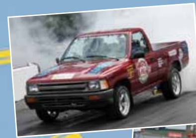
El Chupagabra built by Delta Secondary School British Columbia 14.672 @ 83.58 mph

Whether it is four wheels or two, NEDRA is pushing the limits in electric drag racing. Electric drag bikes including Rocket, Predator, KillaCycle, Silver Giant II and Tron are making record runs down the drag strips all over the world.