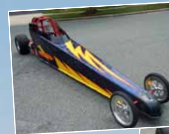
Electric Louie and Munkey's Ride electric jr dragsters

Since electric vehicles are now recognized by the NHRA and IHRA, NEDRA members can race under their local track's rules. NEDRA is an Alternative Sanctioning Organization of the NHRA and a Specialized Chapter of the Electric Auto Association. The F.I.A has adopted NEDRA's safety rules in its drag racing rulebook and the Loring Timing Association has incorporated NEDRA's Voltage Divisions.