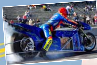
Lawless Rocket bike raced by drag bike legend Larry "Spiderman" McBride 6.940 @ 201.37 mph