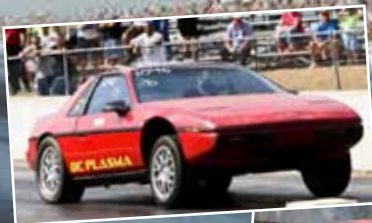
DC Plasma Fiero built and raced by John Metric 9.898 @ 134.42 mph