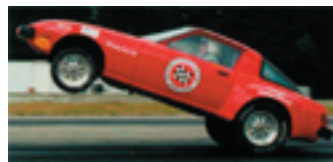
Roderick Wilde's Maniac Mazda. 12.07 seconds at 110.13 mph.

NEDRA vehicles are categorized by Class and Voltage. Classes are determined by the extent of the vehicle's modification from daily drivers such as simple Street Conversions (SC) and Modified Conversions (MC) to extreme racers such as electric funny cars in the Extreme Street (XS) class. Voltage Divisions range from 24 volts to over 348 volts and are represented by letters A through J. For example a Street Conversion running at 144 volts would be categorized as SC/E .