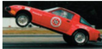
Roderick Wilde's Maniac Mazda. 12.07 seconds at 110.13 mph.

NEDRA vehicles are categorized by Class and Voltage. Classes are determined by the extent of the vehicle's modification from daily drivers such as simple Street Conversions (SC) and Modified Conversions (MC) to extreme racers such as electric funny cars in the Extreme Street (XS) class. Voltage Divisions range from 24 volts to over 348 volts and are represented by letters A through J. For example a Street Conversion running at 144 volts would be categorized as SC/E .