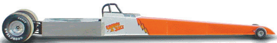
Lawless Industries Orange Juice. 10.8 seconds at 119.5 mph.

Records are achieved by running the best speed and time in your respective class. Records can be obtained at sanctioned NEDRA events or at NHRA events with two timeslips. Visit our website for more information.