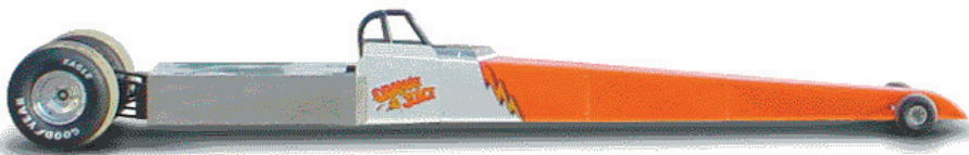
Lawless Industries Orange Juice. 10.8 seconds at 119.5 mph.

NEDRA was formed in 1996 by a group of hardcore amp heads who were out to prove that electric vehicles were more than glorified golf carts. They formed a set of rules which were later adopted by the NHRA. As the sport continued to grow the NHRA adopted rules for electric Jr. Dragsters. Today the sport continues to gain momentum as new vehicles are being built and raced each year. Visit our website at www.nedra.com .